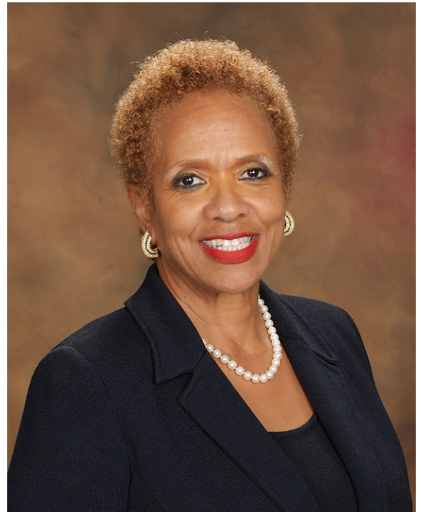
Maricopa NAACP Branch President February 2016 - November 2017